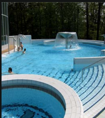
Swimming pool ceramics world wide

The editor disclaims liability for printing errors. Delivery and Payment Conditions apply.