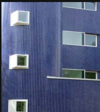
Ceramics for modern facade design