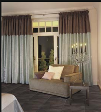
Ceramics for living for highest demands