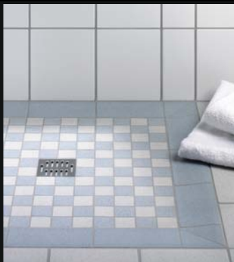
Slip resistance for all areas